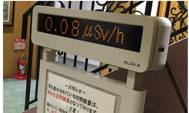
Figure 3. Radiation counter in the hotel, Naraha town