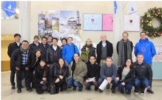
Figure 2. Group photo in J-Village

In the 80 mins full-guided bus tour in the FDNPP site, we saw various locations; building cover installed over Unit 1, giant cranes for handling fuels around/on Unit 3, massive structure for sustaining fuel pools of Unit 4 made by huge amount of steel (almost same as the amount for the Tokyo tower), numerous tanks filled with contaminated water, multinuclide removal facility, reverse osmosis concentrated water treatment facility, sea-side impervious wall, large rest house for site workers, and so on. Our personal dose of this whole tour was below the detection limit of 1 Sv, although the maximum air dose we measured was approximately 300 Sv per hour near Unit 4.