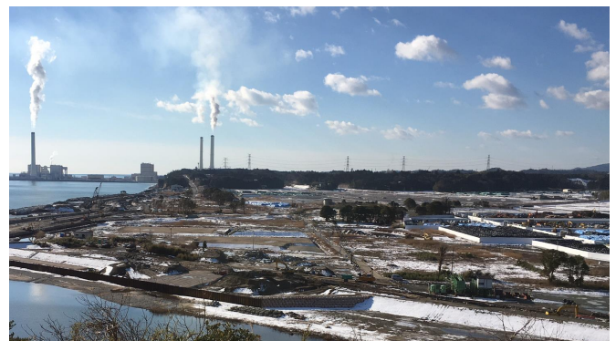
Figure 4. View from Tenjin Cape, Naraha town: Hirono thermal power station and temporal storage site of contaminated waste