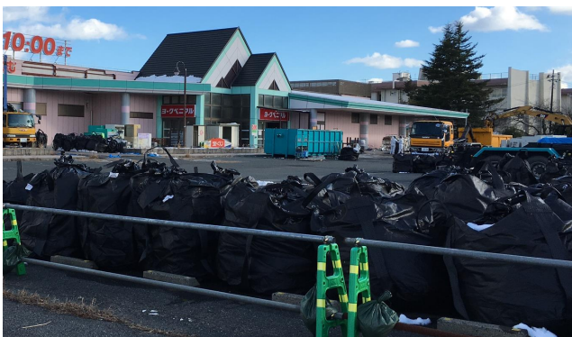
Figure 5. Closed supermarket and decontamination waste, Tomioka town

On the other hand, we grasped that many restaurants and supermarkets in the central Tomioka town were preserved as they were at the time of accident, but covered with dust. We also witnessed the difficulty of bridging the gap between social image and the reality. In Namie town, we visited a roadside place where many cars were derelict in the grass. Web news reported that these cars were abandoned by evacuees in the midst of disruption after the accident. In reality, however, this place had been used as an automobile graveyard before 2011.